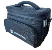
M/G/SP Series Pouch HM-SP01-POUCH

COMPLIANCE NOTICE: The thermal series products might be subject to export controls in various countries or regions, including without limitation, the United States, European Union, United Kingdom and/or other member countries of the Wassenaar Arrangement. Please consult your professional legal or compliance expert or local government authorities for any necessary export license requirements if you intend to transfer, export, re-export the thermal series products between different countries.