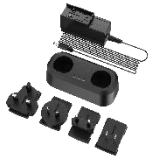
M Series Charging Base HM-5202ZC